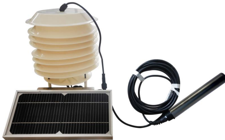
Fig. R72610 Appearance (subject to the actual object)